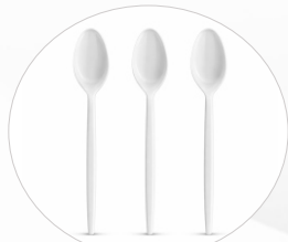
SP 02 PLASTIC SPOON MEDIUM