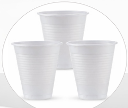
TF 20 PLASTIC CUP