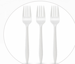
SCFK 01 PLASTIC FORK