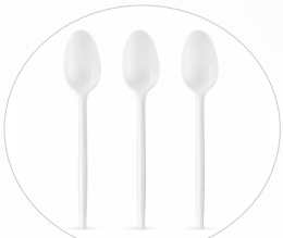
SP 01 PLASTIC SPOON LARGE