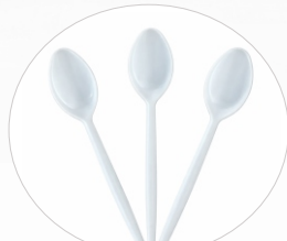
SP 03 PLASTIC SPOON SMALL