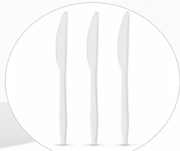
SCKN 01 PLASTIC KNIFE