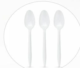
SCSP 01 PLASTIC SPOON