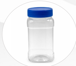
SBS-300 Ø6.2 × 6.5 cm