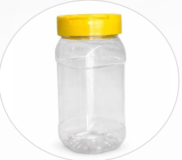
PET-11 M Ø4.5 × 14 cm