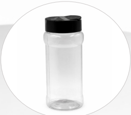
SBR-330 Ø4.8 × 17 cm