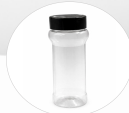
SBR-430 Ø4.8 × 17.3 cm