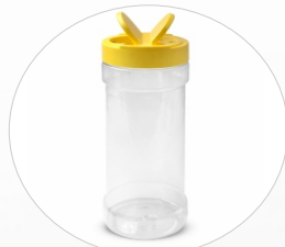
PET-12R Ø5.3 × 12.5 cm