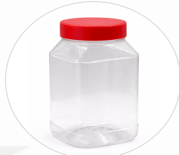
PET-12 Ø5.3 × 16.5 cm