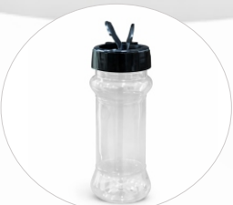
PET-15 Ø3.7 × 11.7 cm