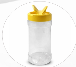
PET-11R Ø5.3 × 14.7 cm