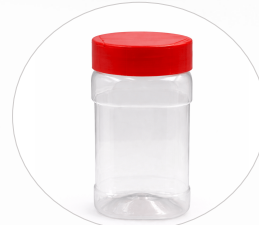
PET-14 Ø3.7 × 10.5 cm