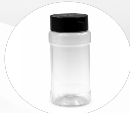
SBR-200 Ø4.5 × 15 cm