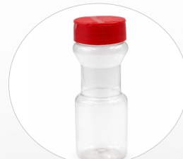
SBR-175 Ø4.8 × 17.3 cm