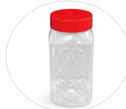
PET-13 Ø4.8 × 14 cm