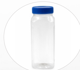
BMQ-01 Ø6.2 × 17.5 cm