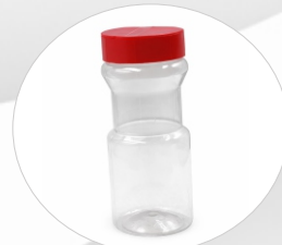
SBR-250 Ø4.8 × 17.3 cm