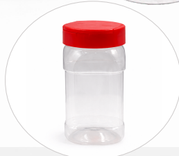
PET-11 Ø5.3 × 13.5 cm