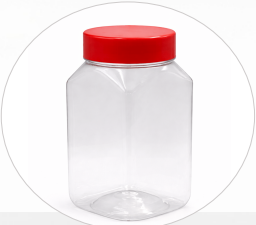
PET-09 Ø4.5 × 14 cm